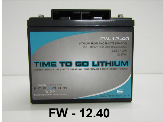
FW - 12.40